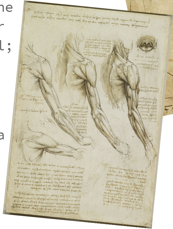
Figure - Human form in a work of art

Anatomy - simply put, the study of bodies whether that is human or animal; both outer and inner structures of living creatures